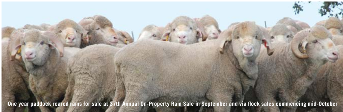
One year paddock reared rams for sale at 37th Annual On-Property Ram Sale in September and via flock sales commencing mid-October

Alternatively, prior to the on-property sale a private inspection of the sale rams can be arranged by appointment with Jono or Charlie.