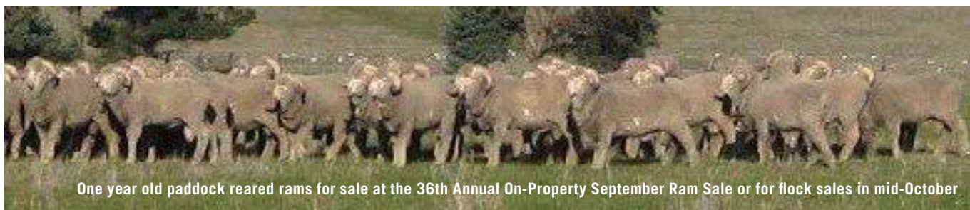
One year old paddock reared rams for sale at the 36th Annual On-Property September Ram Sale or for flock sales in mid-October

At last year's 35th Annual on-property Ram Sale held on Wednesday 26th September 54 of the 60 rams offered were sold for an average of $1,127, and the top price was $2,400 three times, Lots 10, 11 and 29, all rams were May/June 2011 drop and paddock reared. (Prices are GST exclusive)