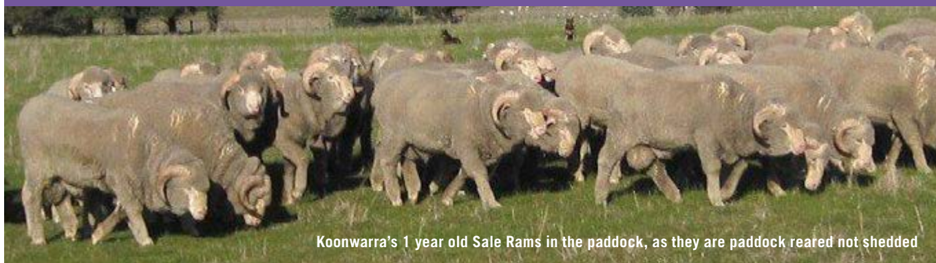
Koonwarra's 1 year old Sale Rams in the paddock, as they are paddock reared not shedded