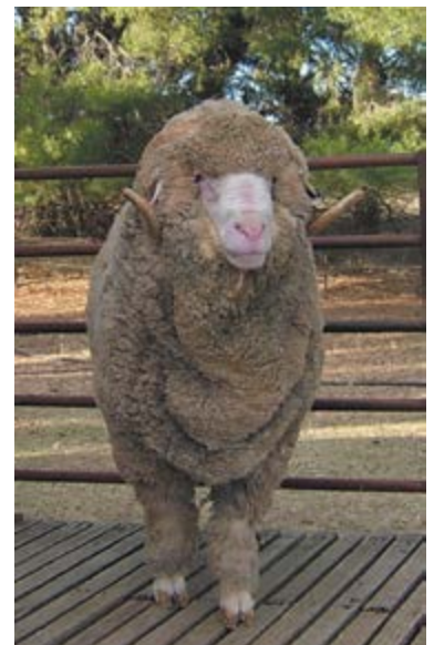
Koonwarra GSSM No.1 sale ram for 2009

NO. 1 RAM A large framed stud sire from the Black Tag BU family. He is a very square stance sire and up straight on his feet, with a good width through the back and front legs, displaying a meaty rear end and good spring of rib. He has a soft strong muzzle and open horn set. His fleece is a quality fine/medium wool with a very good length of staple for his wool type. He has a bulky heavy fleece and plenty of underline/belly. This sire would improve frame size and structure and add plenty of fleece weight to merino flocks. These features are supported by very good fleece figures – micron of 17.7, SD 2.7, CV 15.3 and a comfort factor