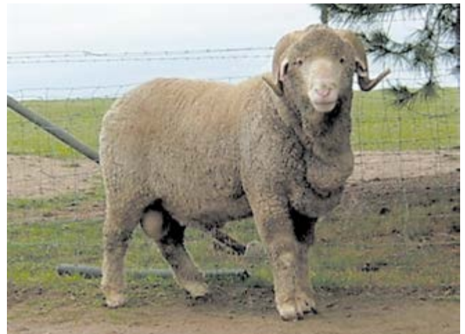
Photo of Ram for sale at GSSM 2009

this AI program in 2007 due to the drought, the quality of these sires' progeny has been very high.