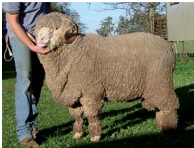
KWA 5.244 "Ruby"

We used "Ruby" in the AI program and with paddock joinings and we feel he is destined to have a good impact on the Koonwarra stud, especially after seeing his first crop of lambs this year. He is a large framed ram with a clearly defined crimp, bright white wool testing 20.8 on full shed feed, very square behind in his stance with big spring of rib. He has a tremendous outlook with a strong head and horn set that so epitomises the Koonwarra blood sires. Another new sire we have used in the 2008 drop is Nerstane 43 in the AI program.