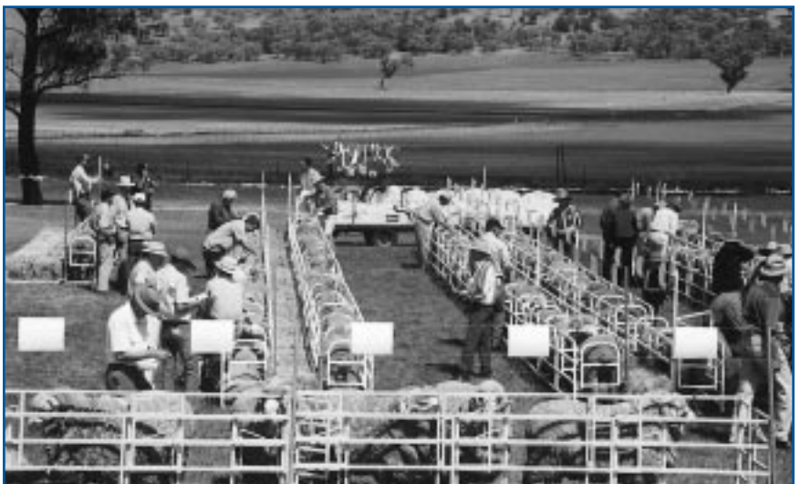
23rd Annual Koonwarra On Property Sale day action

The Koonwarra Quality Upgrade Program will be retained for the 2001 On Property Sale. Once the buyers ram tally has reached five rams at the bid price, all other rams purchased attract a 10% rebate on the purchase price. Seven clients took advantage of this new initiative in 2000. The program has been implemented by Koonwarra to assist clients who have a greater need for quality rams at this time, with our objective being to assist our clients in obtaining the number of rams they require.