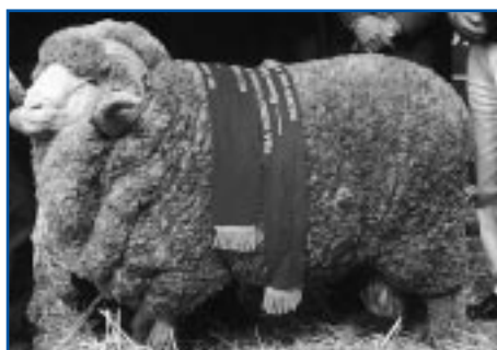
KWA 5.6 at Dubbo National Ram Sale 1998

By and large, the country is quite unforgiving in climate, environment and geography. Principally desert grassland landscapes, ranging from 700 to 2000 meters in altitude, and more often than not, are inundated by snow for approx 6 months or more of the year. Annual rainfall varies from 6-8 inches in the