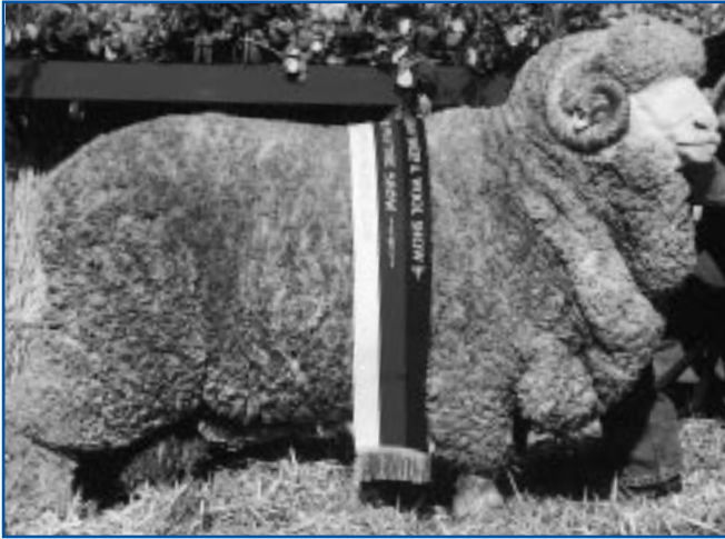
KWA 8.27 ARNOLD Overall Junior Champion Ram, and Reserve Grand Champion Medium Wool Ram at the ASBMA Australian Sheep Show, Bendigo, 2000. Previously judged Reserve Champion Medium Wool August shorn Ram at RAS Sydney Royal Show.

A son of KWA 7.49, with full wool, test results of 20.0 micron, 3.3 SD, 16.7% CV, 99.6% Comfort Factor, on full feed. In his March 2001 test result, he measured 20.0 micron, 3.3 SD, 16.7% CV, 99.5% Comfort Factor, 18.8 micron spinning fineness.