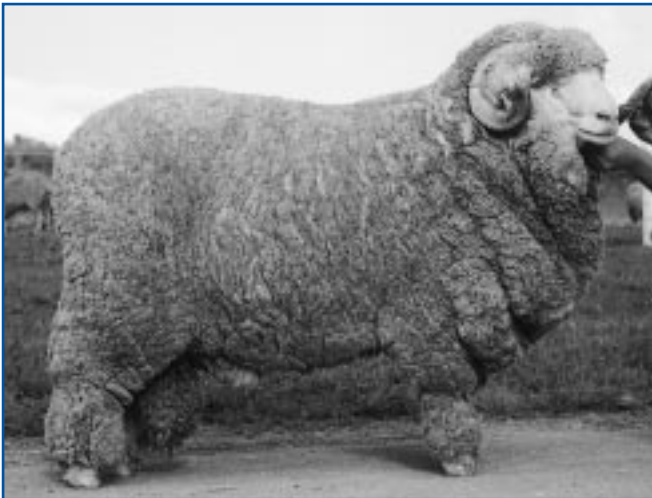
KWA 8.180 "BLOCKER", son of KWA 7.49 Reserve Champion Medium wool August shorn ram, Reserve Junior Champion Ram Canberra 2000. Champion Medium wool ram Cumnock 2000, Junior Champion ram Condobolin 1999. Wool Test results Dubbo 2000, on full feed were, 20.5 micron, 18.9 micron spinning Fineness, 2.9 SD, 14.1% CV, 99.5% Comfort Factor. March 2001 test 18.2 micron, 3.1SD, 17.1% CV, 99.8 Comfort Factor, 17.2 micron Spinning Fineness. Blocker is a ram displaying tremendous spring of rib, outlook, bone, wool coverage and quality.

A son of KWA 7.49, with full wool, test results of 20.0 micron, 3.3 SD, 16.7% CV, 99.6% Comfort Factor, on full feed. In his March 2001 test result, he measured 20.0 micron, 3.3 SD, 16.7% CV, 99.5% Comfort Factor, 18.8 micron spinning fineness.