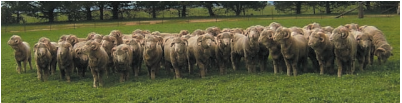
2009 Koonwarra Weaner Sale Rams

Individual details on each of the 60 rams will be available, on the website, www.koonwarrastud.com.au before the sale; however, not until after the fleece tests are taken (about 6 weeks before the sale) and the rams catalogued. Individual body weights will be available on the day of the sale.