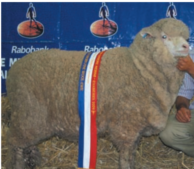
2009 GSSM Champion March Shorn Fine Wool Ewe

At the 2009 GSSM Show in January, Koonwarra won Champion March shorn Fine wool Ewe, and Reserve Champion Medium Wool Sale ram.