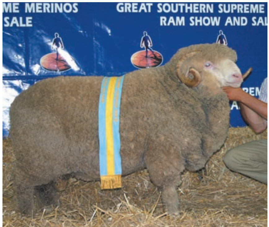
GSSM Reserve Champion Medium Wool Sale Ram – who has progeny in the 2009 on property ram sale

We welcome long term and new clients to Koonwarra Stud at Little Range, Boorowa to come, visit and inspect these well known Koonwarra sheep, and inspect the 2008 drop rams. They are quite an impressive group.