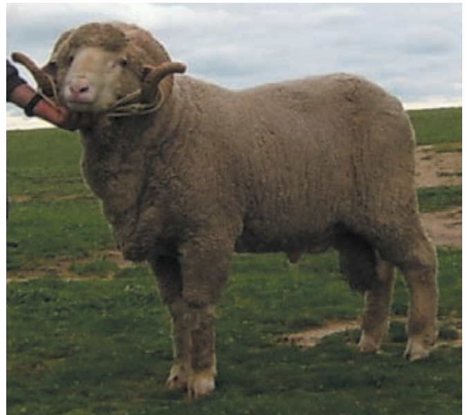
2009 Dubbo Show and Sale Ram

The Koonwarra ewe we will be showing is a 2008 drop ewe sired by Nerstane 4636, the wool type of this ewe is very high quality and a type we are slowly developing at Koonwarra.